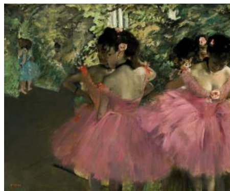
Edgar Degas Dancers in Pink Painting

2010 FIFA World Cup poster Dancers in Pink