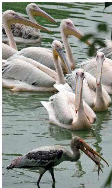
The Zoological Park in New Delhi, 28 July 2007 A painted stork (bottom) is watched by a group of Rosy Pelicans as it catches a fish in a pond Photograph

Traditional Chinese Painting, Koi Carp, Lotus The Zoological Park in New Delhi, 28 July 2007