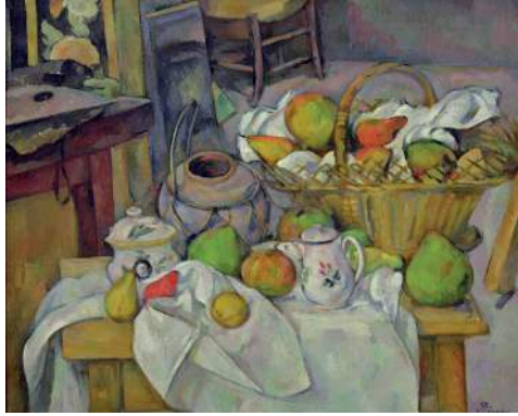
Paul Cézanne Kitchen table (Still-life with basket) Painting