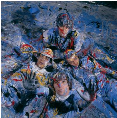
The Stone Roses

West Bengal Dance Group Federation observes International Dance Day at Mohor Kunja, Kolkata Photograph