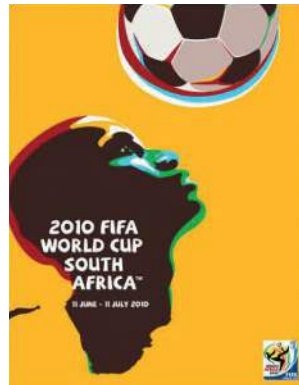
Paul Dale 2010 FIFA World Cup poster Poster