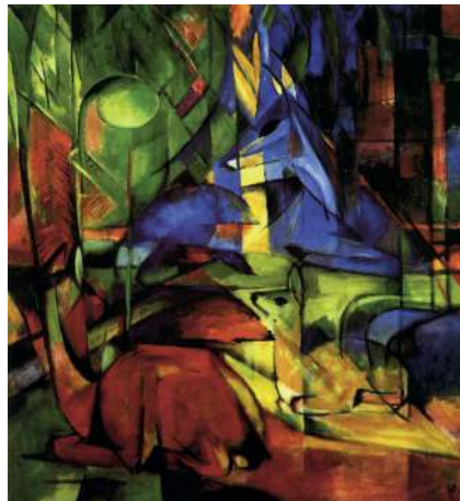
Franz Marc Deer in the Forest Painting

Here are some other suggestions that may stimulate your ideas: