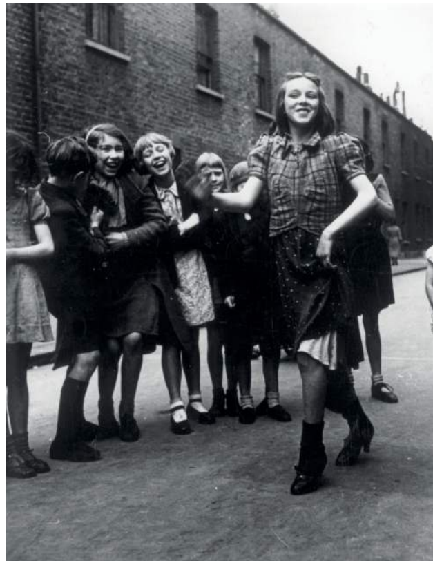
Bill Brandt East End Girl Dancing the Lambeth Walk Photograph