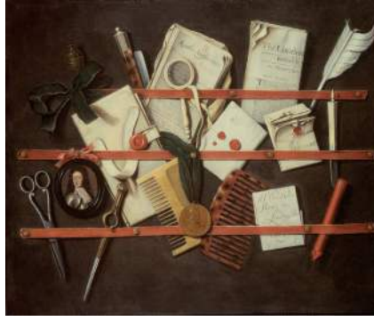
Colyer or Collier, Edwaert (c.1640-c.1707) Trompe l'oeil letter rack with a miniature portrait of a young man in armour, 1697 (panel) Painting