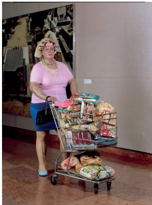
Duane Hanson Supermarket Shopper Sculpture

Here are some other suggestions that may stimulate your ideas: