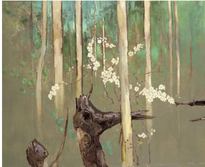
Clifton Ernest Pugh (1924-90) Sapling Forest, Cherry Plum Blossom, 1984 (oil on canvas) Painting