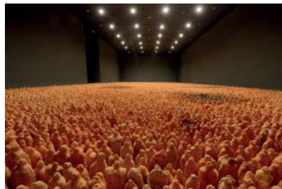
Antony Gormley Field Sculpture/Installation

Antony Gormley, Field