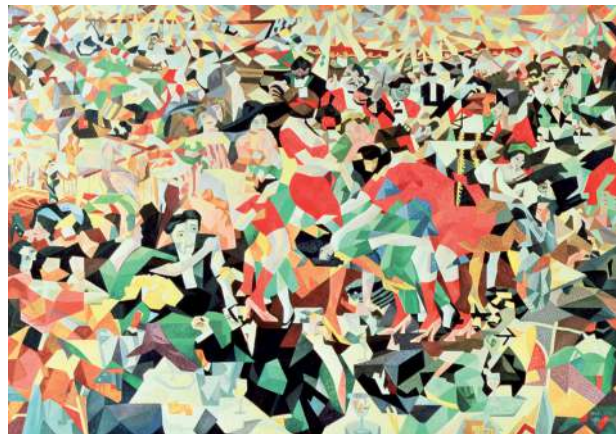
Gino Severini The Pan Pan at the Monico, 1959 (oil on canvas) Painting

Here are some other suggestions that may stimulate your ideas: