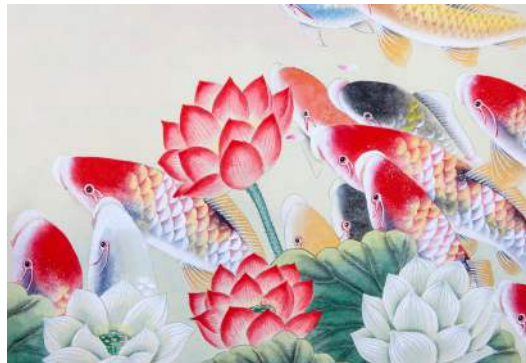
Traditional Chinese Painting Koi Carp Stock Illustration