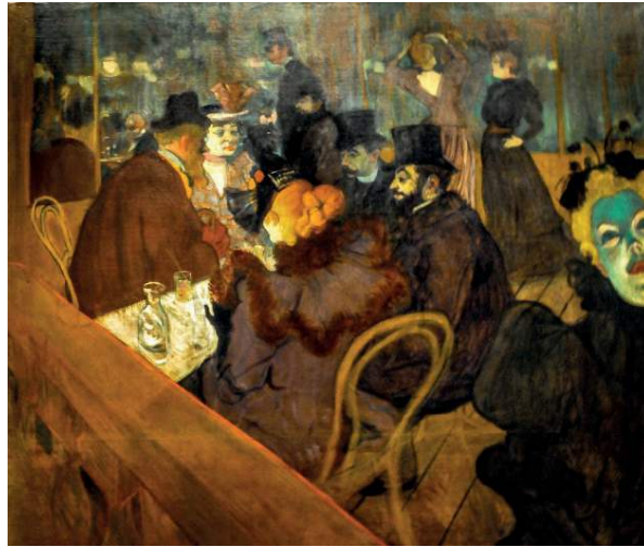
Henri de Toulouse-Lautrec At the Moulin Rouge Painting